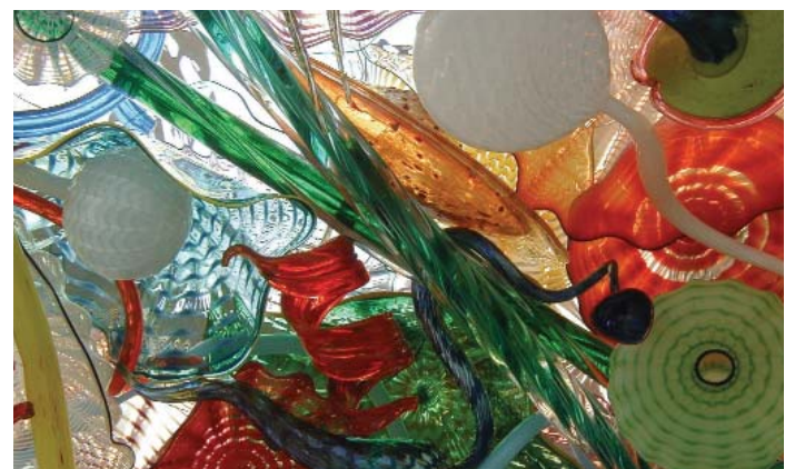
Figure 3: Glass designed by Dale Chihuly, Museum of Glass, Tacoma, WA.

Surface materiality also affects the appearance of a color. A smooth, glossy surface will reflect a hue very differently than a rough surface, and they tend to reflect more light than a matte or rough surface. Matte or rough surfaces reflect light in a scattered, diffuse manner that randomly mixes the wavelengths and tends to soften the color, changing it. Transparent materials allow color and light to be seen through them (see Figure 3). Reflection from glossy paper can make reading a menu or a magazine difficult just as reflection from a highly polished floor can create spatial perceptual challenges.