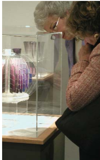
Figure 1: Munsell Color Wheel

A Newsletter by Informedesign. A Web site for design and human behavior research.