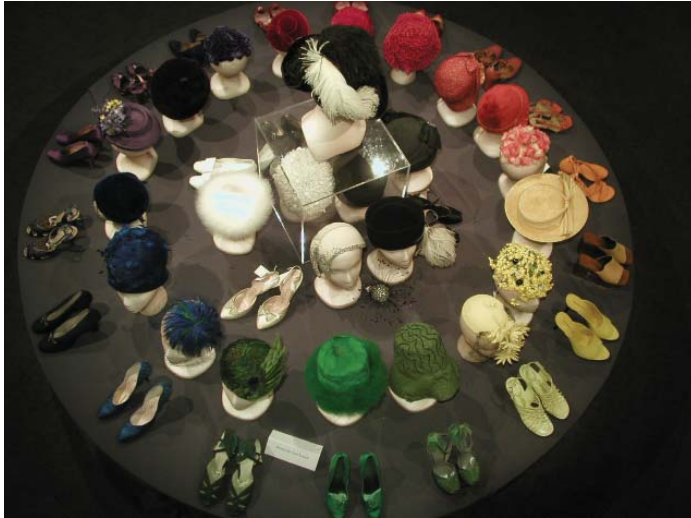
Figure 2: A color wheel made from hats and shoes that are in the collection of the Goldstein Museum of Design.