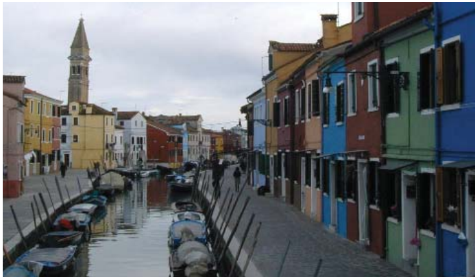
Figure 4: The colorful facades of Burano, Italy.

Albers (1963) discusses the interdependence of color with form and placement, quantity, and quality. It is a constant challenge to predict how a color will look on the designed object when seen under different light sources. While the typical color wheel represents only two or three dimensions, a color system developed by Albert-Vanel attempted to include variations due to surface quality, light, and human perception. This system, called the Planetary color system and developed in 1983, includes not only hue, value, and chroma, but also accounts for contrast and material.