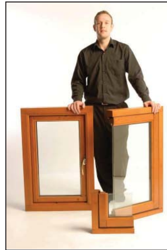
Fig. 7: Kuys’ timberwood frames.

cost-effective distribution due to its limited space requirements during transportation; 100 units can be stacked on a single pallet resulting in fewer fossil fuel miles per unit.