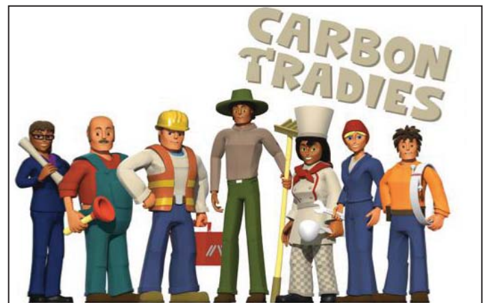
Fig. 3: The seven Carbon Tradies teach energy conservation. Fig. 4 (next page) Examples of the interactive online game from MissionCO2.

The art direction of MissionCO2 uses characters with human proportions and stylized, proportionally correct environments (see Figs. 3 & 4). This realism allows the characters to interact with the objects and environment in a way that is instructional and realistic.