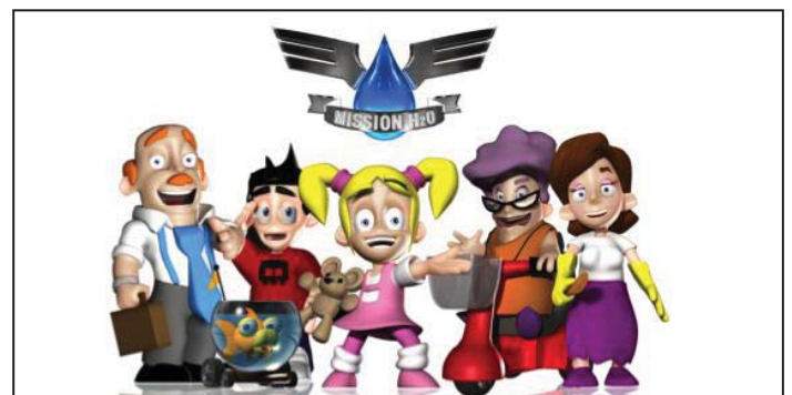
Fig. 1: MissionH2O raises water conservation awareness for K-12 students. Fig. 2: (next page) Examples of the interactive game from MissionH2O .

Play can be a great educator and a way of generating social change. For the last two years, the Multimedia Design undergraduate program has offered capstone projects that involve the development of online computer games. Each game represents the combined work of 80 students and more than 17,000 hours of collective research and development over a twelve-week teaching semester. The games, called MissionH2O and MissionCO2 , target secondary-school students and focus on the sustainable use of water and energy respectively. MissionH2O ( www.missionh2o.com.au ) was launched commercially in 2008 and has received broad press coverage, and many national and international awards for teaching and industry excellence (see Figs. 1 & 2).